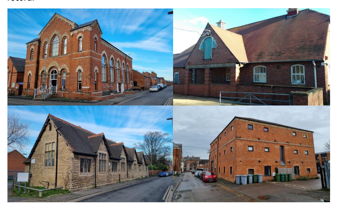
Top left: Former Methodist church on Meyrick Road, Newark; top right: former dairy farm at Brackenhurst; bottom left: former infant school on Lover's Lane, Newark; bottom right: maltings on George Street, Newark.