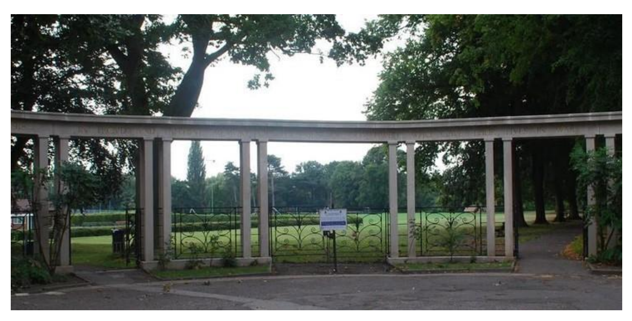
Gate of Remembrance at Southwell. A free-standing concrete memorial in honour of the fallen with incised gold lettering in the top section.

60. Assets with artistic interest may include structures such as war memorials, gate piers or railings. In addition, decorative elements on buildings or structures, such as finials, roof bosses, door surrounds or signage, may also hold a degree of artistic interest.