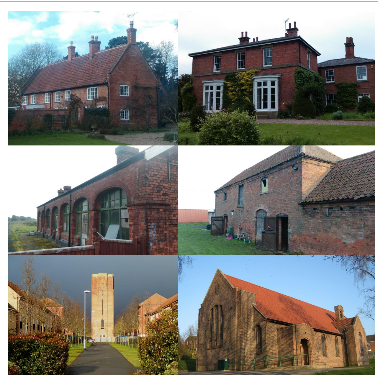
Top left: Traditional post-medieval farmhouse in Gonalston, comprising handmade red brick with distinctive coped gables; top right: 19<sup>th</sup> century villa style vicarage at Hockerton with refined detailing; middle-left: former Victorian station building at Clifton-on-Trent; middle-right: Traditional late 18<sup>th</sup>-century barn range at Staythorpe with rustic estate architecture; bottom-left: the landmark tower at the former Balderton hospital site; bottom-right: St Simon and St Jude, an impressive architectural piece by C. E. Howitt of Nottingham from 1938.