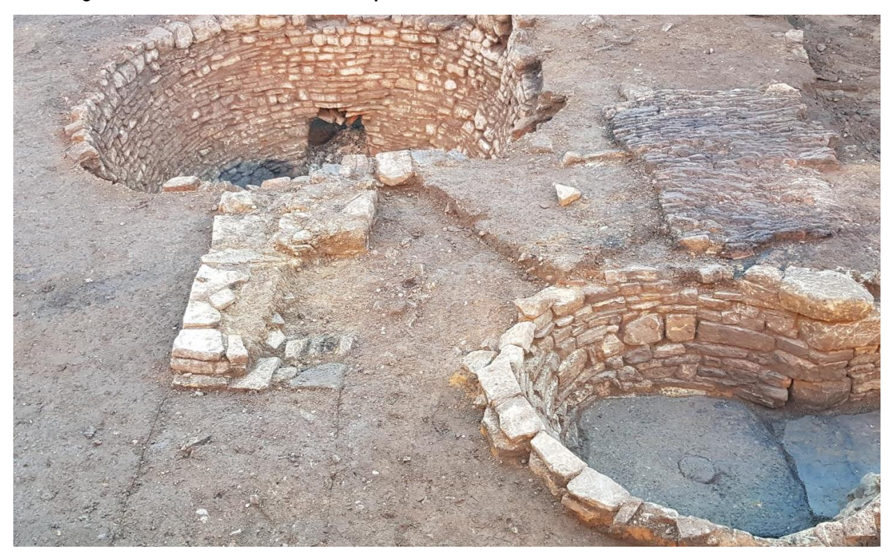
Remains of kilns uncovered during a development project in Newark. Industrial heritage of this nature tells us about historic settlement and economy.

that is in the form of buried remains – but may also be revealed in the structure of buildings or in a manmade landscape ^{20} .