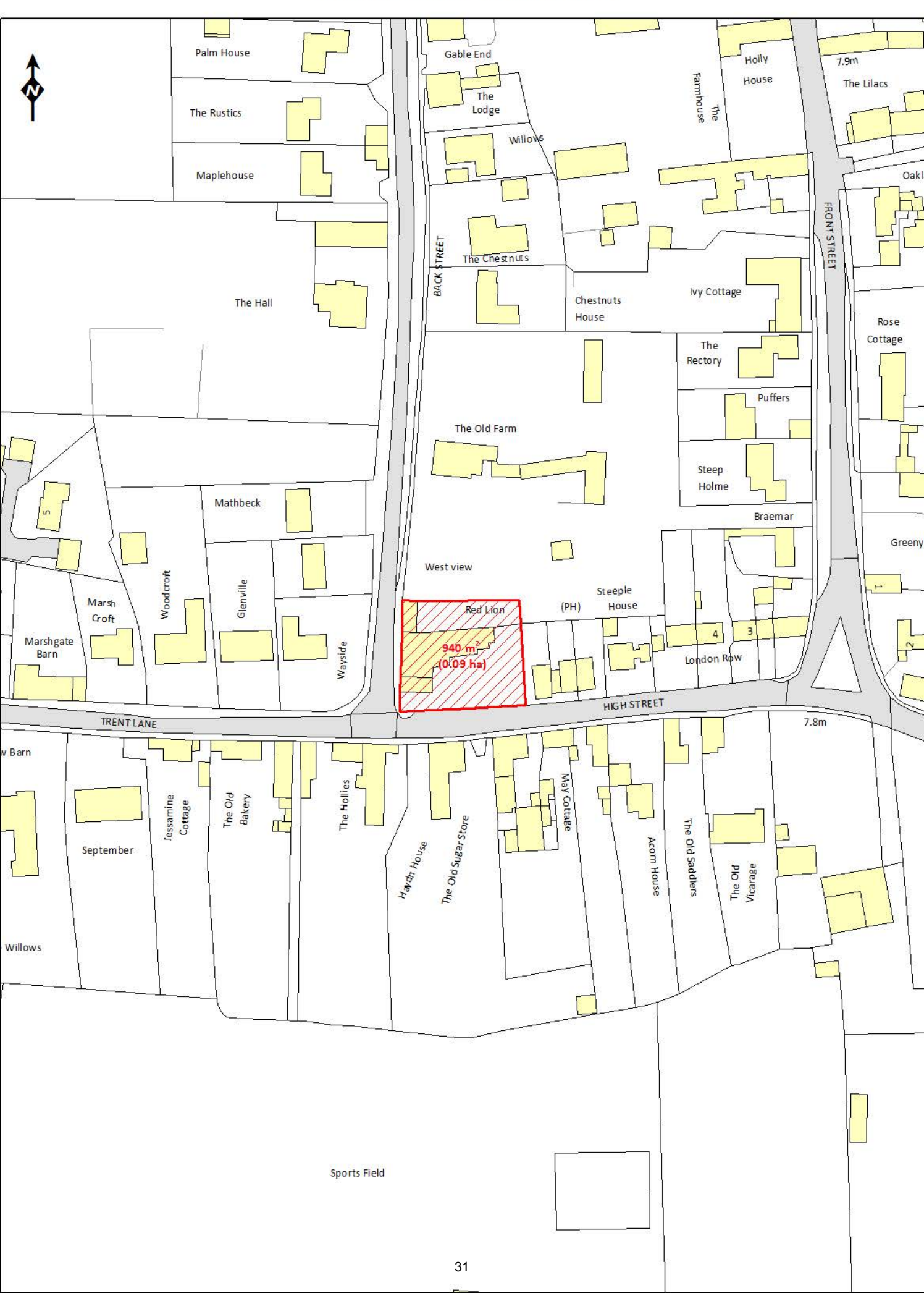
Committee Plan - 16/01052/FUL